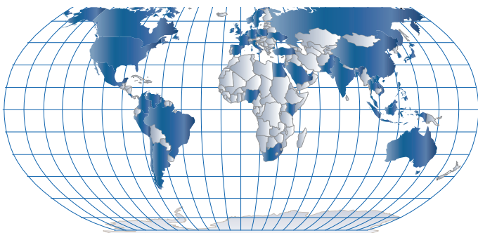
Our Current Coverage